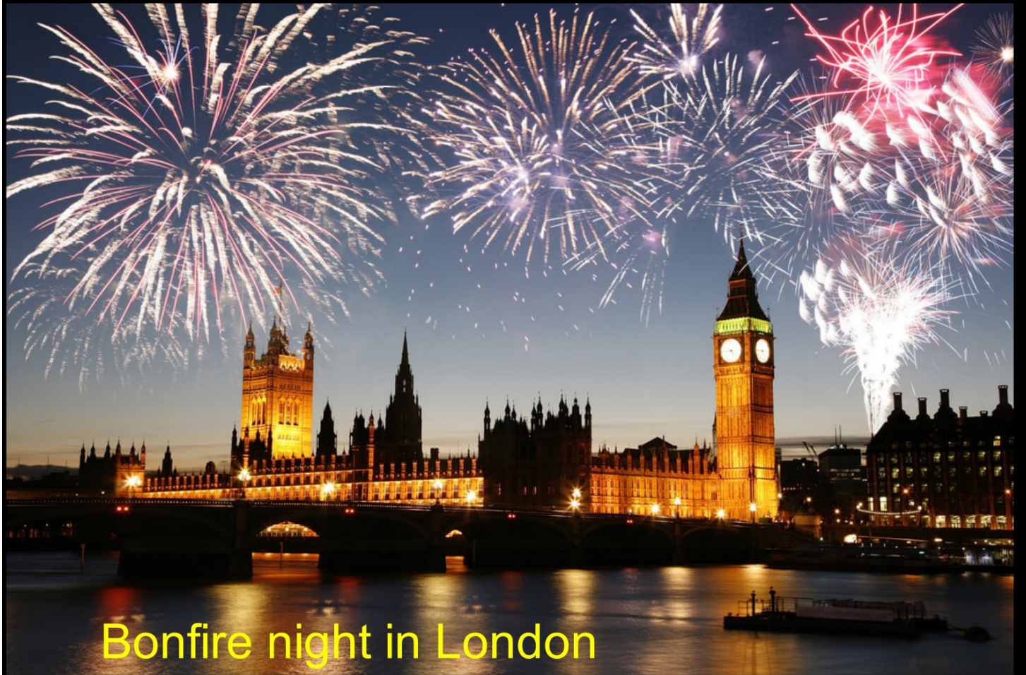
Bonfire night in London